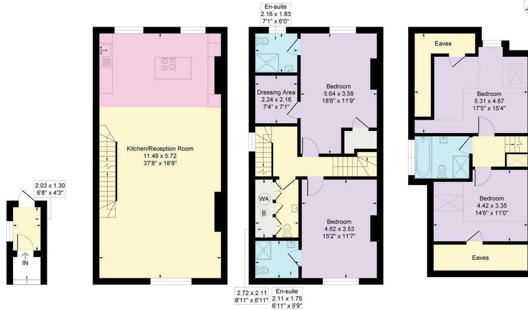
Raised Ground Floor First Floor